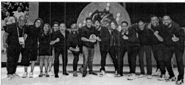
The Leo Burnett Mumbai team celebrates after clinching the Gold medal in 'Creative Data' for Gatorade's 'Turf Defender' campaign late night on Day 3 of the festival

On Day 4 of the Cannes Lions festival, Leo Burnett bagged a Silver for an Oreo campaign, while Ogilvy took home a Bronze for its campaign for Vi. This brings India's total Lions tally to 14 — 2 Golds, 5 Silvers and 7 Bronzes