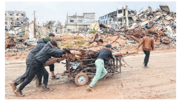
Palestinians transport firewood in Gaza City's southern al Zeitoun neighbourhood on Sunday

Xinhua news agency reported quoting Lebanon's state-run National News Agency. Earlier six people were killed and two others injured in an Israeli drone strike targeting the