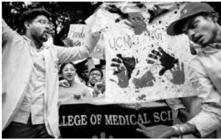
Bengal Chief Minister Mamata Banerjee said the doctors' protest was "definitely a conspiracy by the Centre and some Left parties"