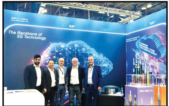
Participation in ECOC 2023 held at Glasgow, Scotland