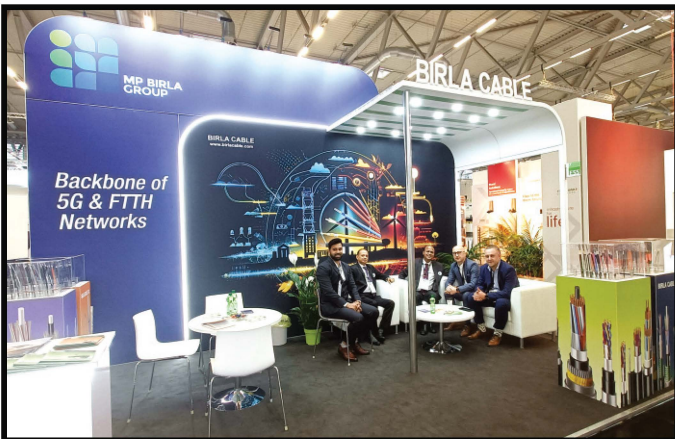
Participation in ANGACOM 2023 held at Cologne, Germany.