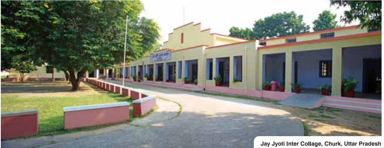
Jay Jyoti Inter Collage, Churk, Uttar Pradesh