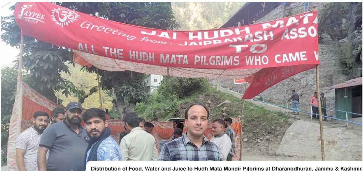
Distribution of Food, Water and Juice to Hudh Mata Mandir Pilgrims at Dharangdhuran, Jammu & Kashmir.