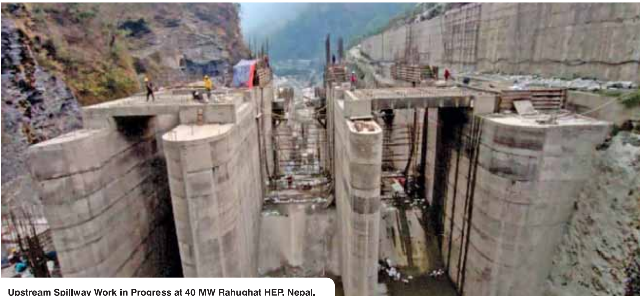
Upstream Spillway Work in Progress at 40 MW Rahughat HEP, Nepal.