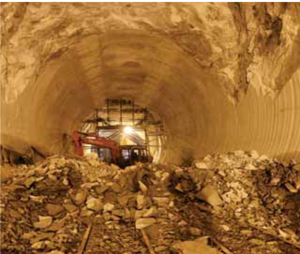
Niche Excavation Work in Progress at Alimineti Madhva Reddy, Irrigation Tunnel, Andhra Pradesh.