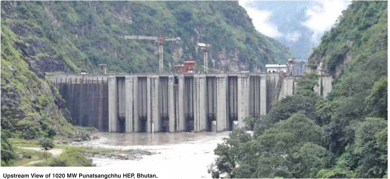
Upstream View of 1020 MW Punatsangchu HEP, Bhutan.