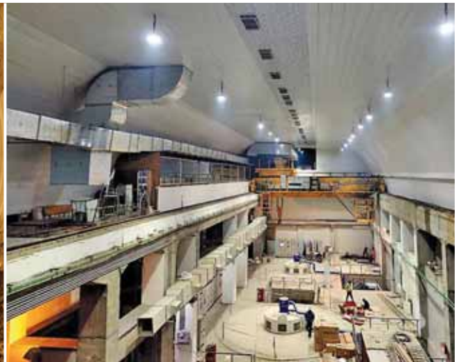
Machine Hall at 60 MW Naitwar Mori HEP, Uttarkashi, Uttarakhand.