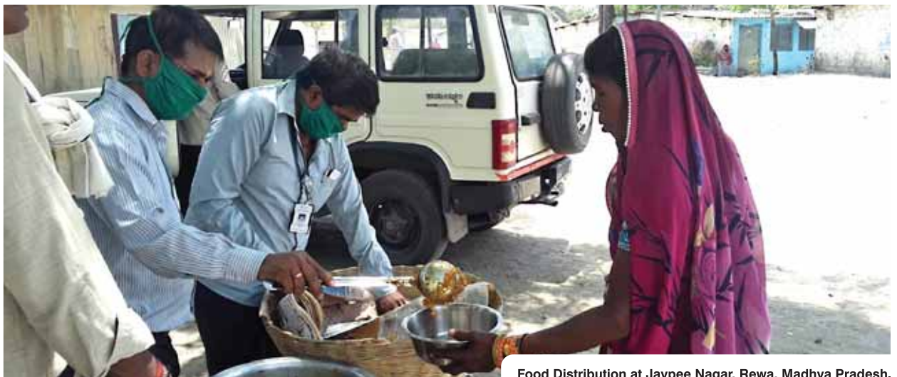
Food Distribution at Jaypee Nagar, Rewa, Madhya Pradesh.