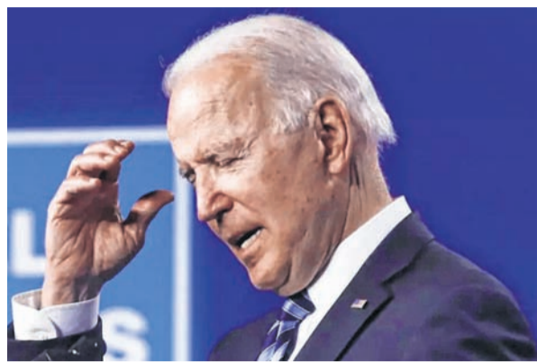
Joe Biden speaking at a podium.

President Joe Biden late Friday dissected former President Donald Trump's speech accepting the Republican nomination the night before with a lengthy 13-post thread on X, coupled with a fundraising plea, in which he calls out his rival for different things he said.