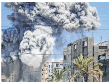
Aerial view of a building in Gaza with smoke rising from it.