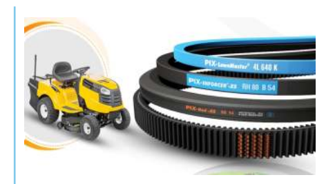
Lawn Mover Belts