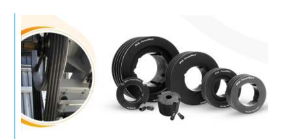
Pulleys & Bushes