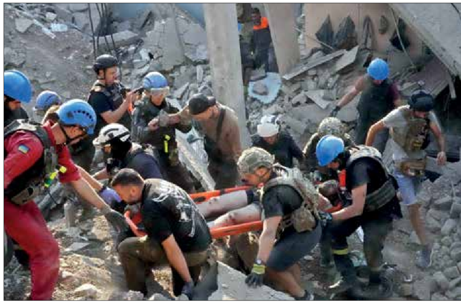
Rescuers carry an injured man after Russian missile attack on the city palace of sports in Kharkiv

POLTAVA: Two ballistic missiles blasted a military training facility and nearby hospital Tuesday in Ukraine, killing at least 50 people and wounding more than 200 others, Ukrainian officials said, in one of the deadliest Russian strikes since the war began.