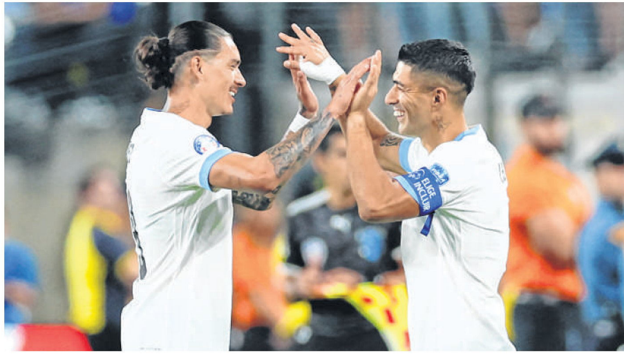
Uruguay's Darwin Nunez (L) shakes hands with his teammate Luis Suarez

Darwin Núñez scored in his seventh straight international match, and Uruguay routed Bolivia 5-0 on Thursday night to move to verge of a quarter-final berth in the Copa America.