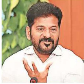
The Telangana CM says when Modi became CM, he included his caste among the BC list

TELANGANA CHIEF Minister Revanth Reddy's comments on Prime Minister Narendra Modi's caste has sparked a row in the state, with the Bharatiya Janata Party accusing him of indulging in "desperate diversion tactics".