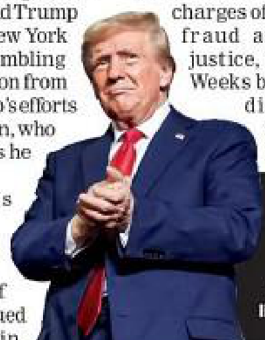
Donald Trump's presidential campaign called the film a defamatory work of "pure fiction which sensationalises lies that have long been debunked"

Cohn was indicted four times on charges of extortion, securities fraud and obstruction of justice, but never convicted. Weeks before he died, he was disbarred for, among other offences, defrauding clients.