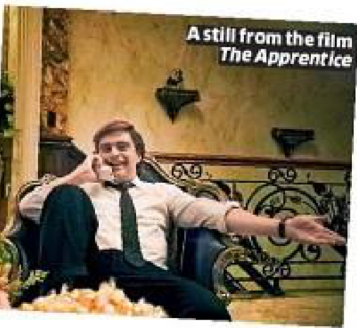
A still from the film 'The Apprentice'