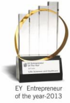
EY Entrepreneur of the year-2013