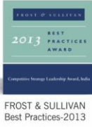
FROST & SULLIVAN Best Practices-2013