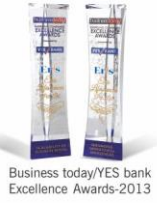
Business today/YES bank Excellence Awards-2013