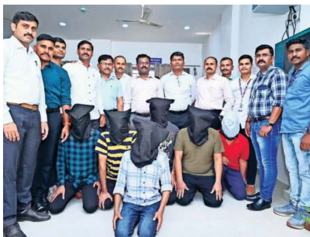
The investigation team with the arrested suspects.