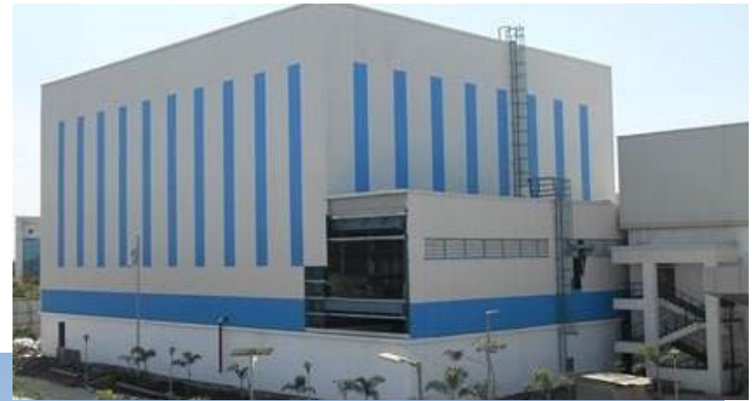
Mylan Labs - Indore