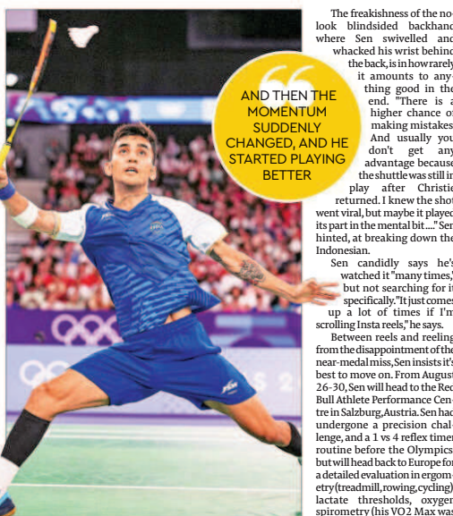
AND THEN THE MOMENTUM SUDDENLY CHANGED, AND HE STARTED PLAYING BETTER

It was audacity that had brought Sen until here, earning the right to even the defending champion in the semis. Axelsen is now double Olympic cham-