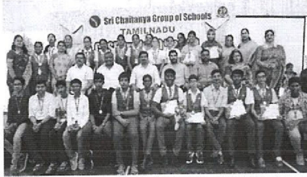
மாணவிகள் 100% தேர்ச்சி பெற்றன. சி.பி.எஸ்.இ. பள்ளியில் 10 ஆம் வகுப்பு தேர்வில் 100% தேர்ச்சி பெற்றன.