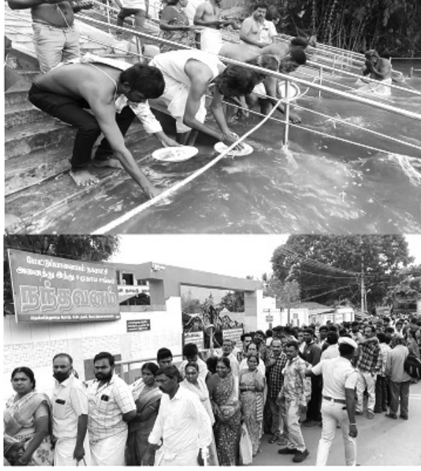
During Aadi Amavasai, people performed special rituals at Anaithu Hindu Samuthaya Nandanavam situated on the banks of Bhavani river in Mettupalayam in Coimbatore district. Elaborate arrangements were made by the management facilitating the people who thronged the Nandanavam from Tirupur, Nilgiris and Coimbatore to perform 'Tarpanam' to the ancestors.

In Mettupalayam, the Anaithu Hindu Samuthaya Nandanavam at the banks of Bhavani river on Mettupalayam in Coimbatore district. Elaborate arrangements were made by the management facilitating the people who thronged the Nandanavam from Tirupur, Nilgiris and Coimbatore to perform 'Tarpanam' to the ancestors.