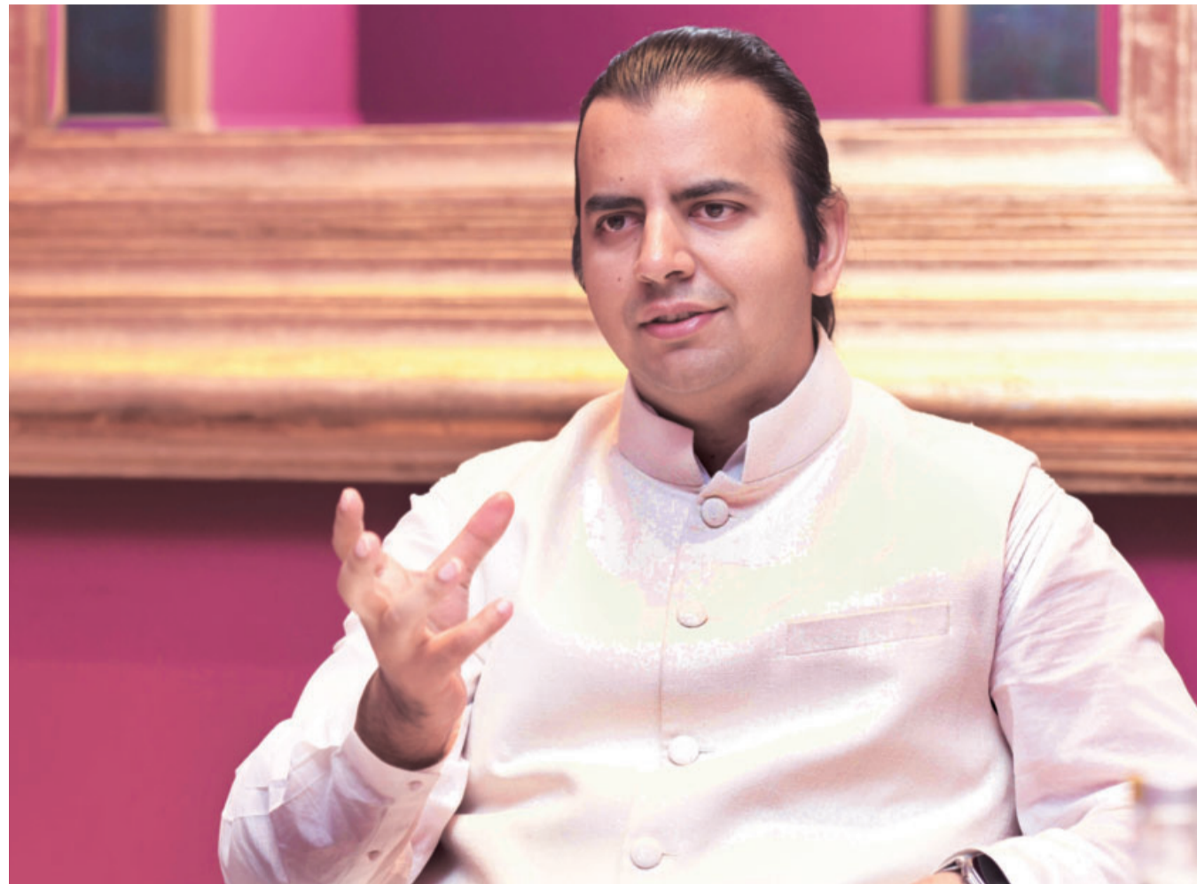
Bhavish Aggarwal has hinted at the launch of two more models, the Sportster and Arrowhead, in the near future

The electric mobike market has been languishing. The largest player in it, Revolt Motors, sold only over 7,000 electric mobikes in 2023-24. Pune-based Tork Motors, in which Aggarwal and Bharat Forge had put in money, has stopped selling according to reports.