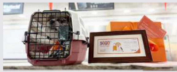
After launching its pet travel facility in 2022, Akasa Air has flown over 5,300 cats and dogs on domestic routes.

WINGING THEIR WAY Take Akasa Air, which launched its pet travel facility in November 2022 and