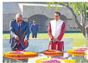
United Nations General Assembly (UNGA) President Philemon Yang pays tribute to Mahatma Gandhi at Rajghat, in New Delhi