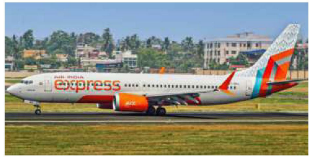
SPREADING WINGS India has over 800 commercial aircraft

The CMO cited that domestic air traffic is expected