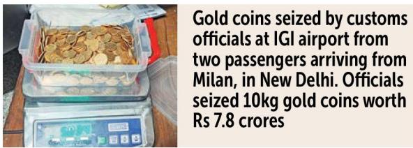
Gold coins seized by customs officials at IGI airport from two passengers arriving from Milan, in New Delhi. Officials seized 10kg gold coins worth Rs 7.8 crores