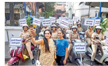
Mumbai Polices women personnel during a Beti Bachao Beti Padhao campaign, in Mumbai