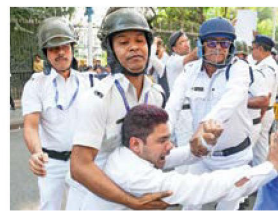
A member of Chhatra Parishad being detained during a march towards Guv House to protest against RSS chief Mohan Bhagwat over his 'true independence' comment in Kolkata, West Bengal