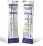
Business today/YES bank Excellence Awards-2013