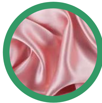
Anaura (rpet Fabric)