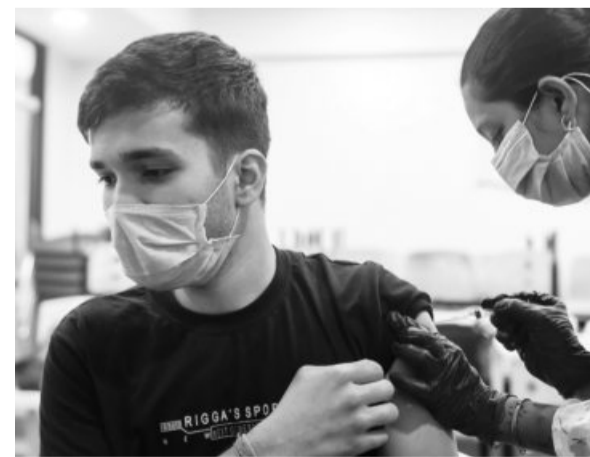
The panel also reviewed data on Covaxin and Corbevax vaccines for the 6-12 age group

The panel members found a lack of uniformity in results upon mixing of jobs for booster shots and stated that no recommendation for it can be made as of now. The CMC study was on Covishield and Covaxin. The threat of monkey-