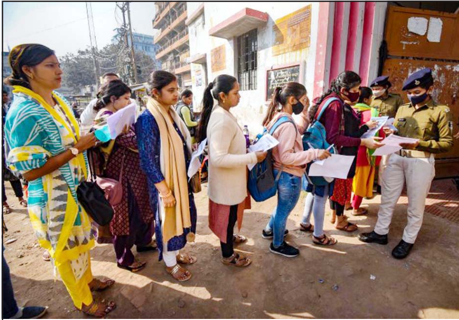
બિહાર પબ્લિક સર્વિસ કમિશન (બીપીએસસી)ની રવિવારે યોજાયેલી દરમિયાન પડના ખાતેના એક પરીક્ષા કેન્દ્ર પર ઉમેદવારોને અંદર પ્રવેશ આપતા પહેલા તેમના ડોક્યુમેન્ટ્સ વેરીફાઇ કરવામાં આવી રહ્યા છે.