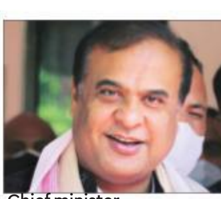
Chief minister Himanta Biswa Sarma

THE ASSAM GOVERNMENT will spend ₹810 crore to resolve issues concerning two defunct paper mills of Hindustan Paper Corporation, chief minister Himanta Biswa Sarma said on Thursday.