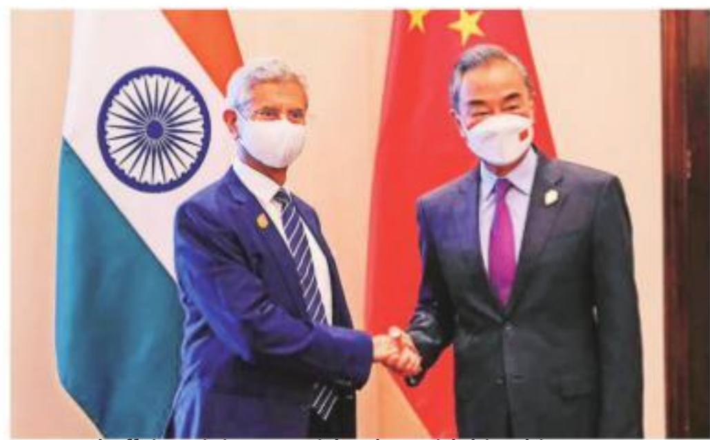
External Affairs Minister S Jaishankar with his Chinese counterpart Wang Yi in Bali on Thursday