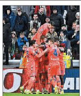
Lautaro Martinez celebrates his goal against Udinese in Turin on Monday.

Turin (Italy): Juventus' title hopes suffered a blow in a 1-0 home defeat by lowly Udinese in Serie A on Monday after defender Lautaro Martinez scored in the first half to leave Massimiliano Allegri's side without a win in three games. Juve are second on 53 points, seven adrift of Inter Milan, who have a game in hand, and a point ahead of AC Milan. Inter won 4-2 at AS Roma on Saturday while third-placed Milan earned a 1-0 win over visiting champions Napoli on Sunday. "We could have done better," Allegri told DAZN. "In the first half we played a good game technically but when