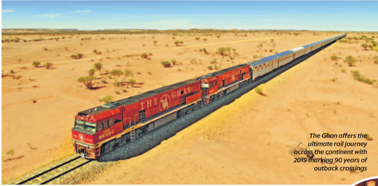
The Ghan offers the ultimate rail journey across the continent with 2019 marking 90 years of outback crossings

Come, fall in love with this unique way of exploring Australia that connects the destination's beautiful landscapes to its iconic cities