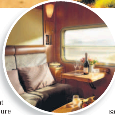
From inside and outside your Platinum Service Cabin aboard the Indian Pacific, you'll be captivated by the vast beauty of this magnificent country

Day One: Board at Sydney's Central Station and settle into your cabin, where you'll spend the afternoon taking in the scenery as it transforms from skyscrapers