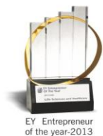
EY Entrepreneur of the year-2013