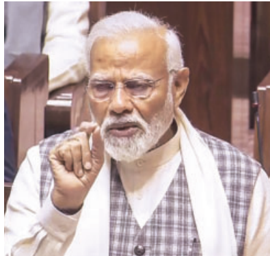
PM Narendra Modi in Rajya Sabha during the Budget session on Wednesday

Prime Minister (PM) Narendra Modi on Wednesday accused the Congress, whose Karnataka Chief Minister (CM) Siddaramaiah and ministers protested the Centre's "injustice" in the devolution of funds to the state, of shaping narratives that could threaten the unity of the country, such as the North versus South debate that the party had triggered.