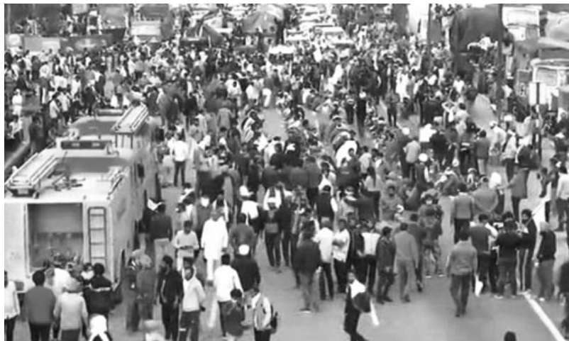
Farmers have expressed apprehensions that the laws will pave the way for eliminating the safety cushion of MSP

The apex court had on January 11 stayed the implementation of the three