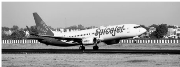
The airline is working to shift its systems to a secured server

Responding to the issue, SpiceJet said: "Certain