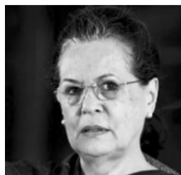
"Announcements such as those related to the National Education Policy should really worry the Opposition as they are a setback for secular and scientific values and reveal the 'insensitivity' of the government" SONIA GANDHI , Congress president

The meeting was focused on the Centre's handling of Covid-19, but avoided direct comment on rising infections because after autonomy to state governments given by the Centre, they themselves would be culpable. Instead, CMs trained their guns on the secondary management of the impact of the pandemic: the issue of entrance examinations for professional institutions (NEET and JEE); and the sharing of GST compensation, given that a GST Council meeting is due