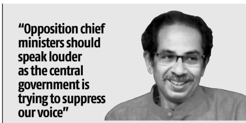
"Opposition chief ministers should speak louder as the central government is trying to suppress our voice" "We should decide whether we have to fight or fear the central government" UDDHAV THACKERAY , Maharashtra CM

On August 27. In her opening remarks, Sonia noted that while the responsibility of managing the pandemic had been passed on to the state governments, the money to fund the health emergency had not been forthcoming. She referred to the statement by the finance secretary a few days ago at a parliamentary standing committee that the Centre was not in a position to give 14 per cent GST compensation to the states and said this was nothing short of betrayal. She expressed grave concern at the National Education Policy and wondered at the impact it would have on all levels of education. Uddhav said the example of the US, where schools had been opening leading to a huge spike in infection was before India, as was the wanton disregard of the Centre of this aspect. "We have to decide whether we want to fear or fight the government. The people who elected the Bharatiya Janata Party at the Centre also elected all of us. But if we do something, it is paap (sin), and if they do anything, it