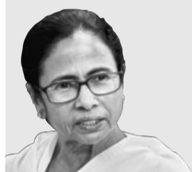
MAMATA BANERJEE , West Bengal CM

On August 27. In her opening remarks, Sonia noted that while the responsibility of managing the pandemic had been passed on to the state governments, the money to fund the health emergency had not been forthcoming. She referred to the statement by the finance secretary a few days ago at a parliamentary standing committee that the Centre was not in a position to give 14 per cent GST compensation to the states and said this was nothing short of betrayal. She expressed grave concern at the National Education Policy and wondered at the impact it would have on all levels of education. Uddhav said the example of the US, where schools had been opening leading to a huge spike in infection was before India, as was the wanton disregard of the Centre of this aspect. "We have to decide whether we want to fear or fight the government. The people who elected the Bharatiya Janata Party at the Centre also elected all of us. But if we do something, it is paap (sin), and if they do anything, it