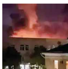
Mayor Sergei Sobyanin said. Two more drones were shot down over the southern region

One drone targeted Moscow, but was shot down southeast of the city without causing any damage or injuries,