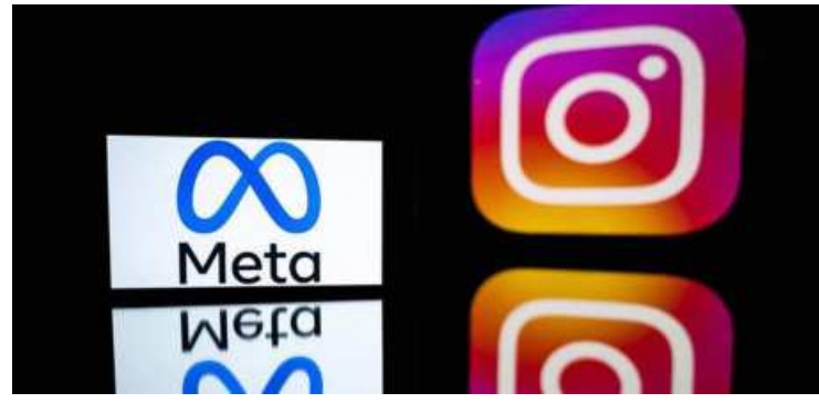
AIDING NETIZENS. Users will have the option to appeal against the decision of the grievance officers of the social media intermediaries before the GAC.