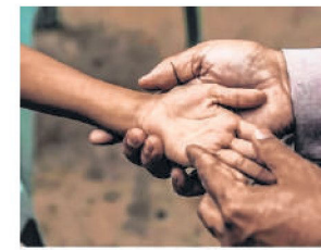
Due to their weak immunity, children in homes with infected adults are most vulnerable to mycobacterium leprae.

rosy cases among children from 12 percent in 2010-11 to the current 5-6 percent of overall cases, the World Health Organization notes that leprosy remains endemic in several Indian states.