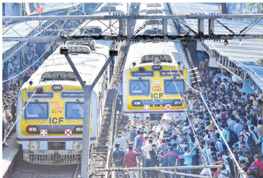
Youth Congress members blocked a train at Dadar railway station