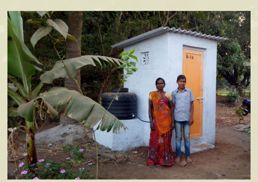
Atul Foundation has so far built ~5,000 toilets in 36 villages.