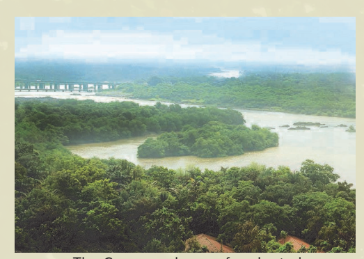
The Company has so far planted ~10 lakhs trees at Atul site.