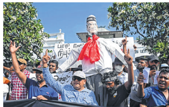
Demonstrators carry an effigy of interim Sri Lanka's President Ranil Wickremesinghe during a protest in Colombo on Tuesday.

Wickremesinghe, Alahapperuma and leftist Janatha Vimukthi Peramuna (JVP) leader Anura Kumara Dissanayake were proposed by lawmakers on Tuesday as the three candidates for the July 20 presidential election to pick the successor to Gotabaya Rajapaksa after he resigned following a popular uprising against his government for mismanaging the