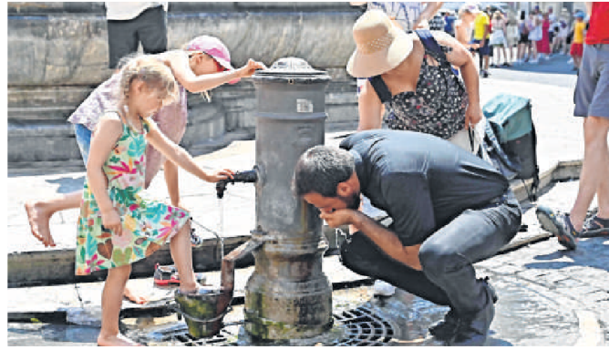
Tourists cool off and drink in a fountain amid a fierce heatwave which sweeps Europe. (Right) UK roads seen melting due to the heat.

Forecasters said an absolute maximum of 43C (109F) is possible later on - and the highs in England are equal to the warmest spots anywhere in Europe. The UK is also hotter than Ja-