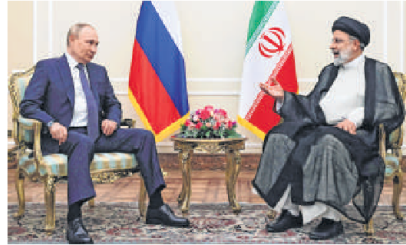
Vladimir Putin and Iran's President Ebrahim Raisi hold a meeting in Tehran on Tuesday.

The Russian leader will meet President Ebrahim Raisi and Ayatollah Khamenei, the Islamic Republic's supreme leader, during the talks aimed at boosting ties between the regimes, Daily Mail reported.