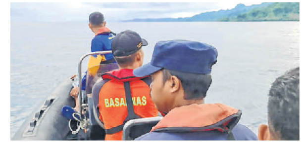
A rescue team searching for victims near Maluku islands.

Personnel from the office and the local disaster management agency, soldiers, policemen and volunteers have been carrying out a search and rescue operation, as 64 people have so far been rescued, Xinhua news agency reported quoting the spokesman. "Search and rescue for the missing is under way now," he said. The rescuers were combing the area around the coasts, the spokesman said.