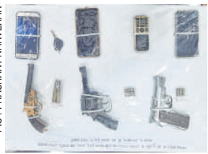
areas and will be meeting at Jalsa country bar in this regard.