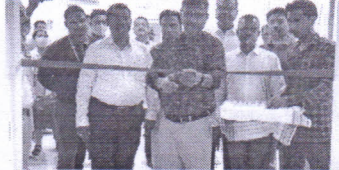
অপিজি প্ৰকল্পৰ অধীনত ৬০ জন চিকিৎসাৰৰ বাবে উদ্বোধনীৰ পিছতে উপায়ক্ৰমই মুকলি কৰিলে বৰপেটা কেঞ্চাৰ হাস্পাতালৰ অপিজি।

দৈনন্দিন বাৰ্তাৰ সেৱা, বৃহস্পতি, ২৯ এপ্রিল : অপিজি প্ৰকল্পৰ অধীনত ৬০ জন চিকিৎসাৰৰ বাবে উদ্বোধনীৰ পিছতে উপায়ক্ৰমই মুকলি কৰিলে বৰপেটা কেঞ্চাৰ হাস্পাতালৰ অপিজি। প্ৰথম দিনাই ৫০ কৰ্কট ৰোগীয়ে কৰিলে স্বাস্থ্য পৰীক্ষা। অপিজি প্ৰকল্পৰ অধীনত ৬০ জন চিকিৎসাৰৰ বাবে উদ্বোধনীৰ পিছতে উপায়ক্ৰমই মুকলি কৰিলে বৰপেটা কেঞ্চাৰ হাস্পাতালৰ অপিজি। প্ৰথম দিনাই ৫০ কৰ্কট ৰোগীয়ে কৰিলে স্বাস্থ্য পৰীক্ষা।