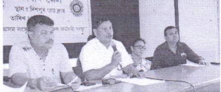
স্বাস্থ্য আৰু কল্যাণৰ উন্নয়নৰ বাবে বিভিন্ন প্ৰকল্পৰ বাবে ৫০ কোটি টকা ব্যয় কৰিবলৈ কৰা হোৱাৰ কথা জানুৱাই দিয়া হৈছে।