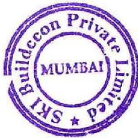
SKI Buildcon Private Limited Promoter Group