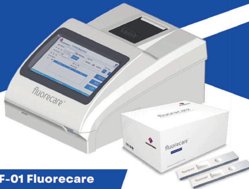
MF-01 Fluorecare MF-T 1000 Reader

Fluorecare Immunofluorescence Quantitative Platform uses immunochromatographic technology, aiming for the diagnosis of common human diseases. Based on specific antigen-antibody reaction, the triggered fluorescence of the fluorochrome-labeled complexes is collected and automatically calculated. For certain analyte, including serum, plasma, urine or other sample, fluorecare is able to measure the concentration of various biological markers including tumor markers, hormone markers, infection markers, cardiac markers and diabetes markers with excellent accuracy and easy operation.