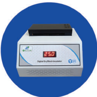
T 25 DIGITAL DRY BLOCK INCUBATOR

Fluorecare Immunofluorescence Quantitative Platform uses immunochromatographic technology, aiming for the diagnosis of common human diseases. Based on specific antigen-antibody reaction, the triggered fluorescence of the fluorochrome-labeled complexes is collected and automatically calculated. For certain analyte, including serum, plasma, urine or other sample, fluorecare is able to measure the concentration of various biological markers including tumor markers, hormone markers, infection markers, cardiac markers and diabetes markers with excellent accuracy and easy operation.