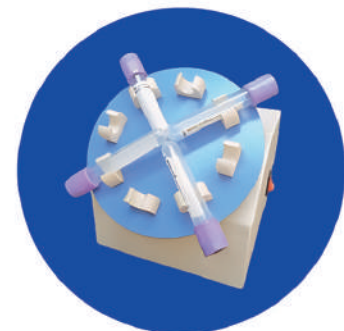
HM-01 HEMATOLOGY BLOOD MIXER