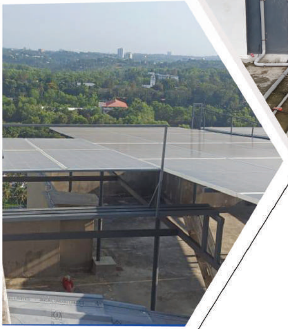
Various Solar Projects undertaken across the state of Kerala