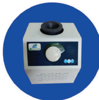
SMD-01 VORTEX MIXER