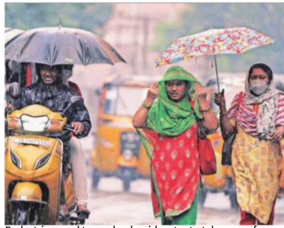
Pedestrians and two-wheeler riders try to take cover from monsoon showers in Hyderabad

Central India, south peninsula and northwest regions have received 17%, 28% and 5%