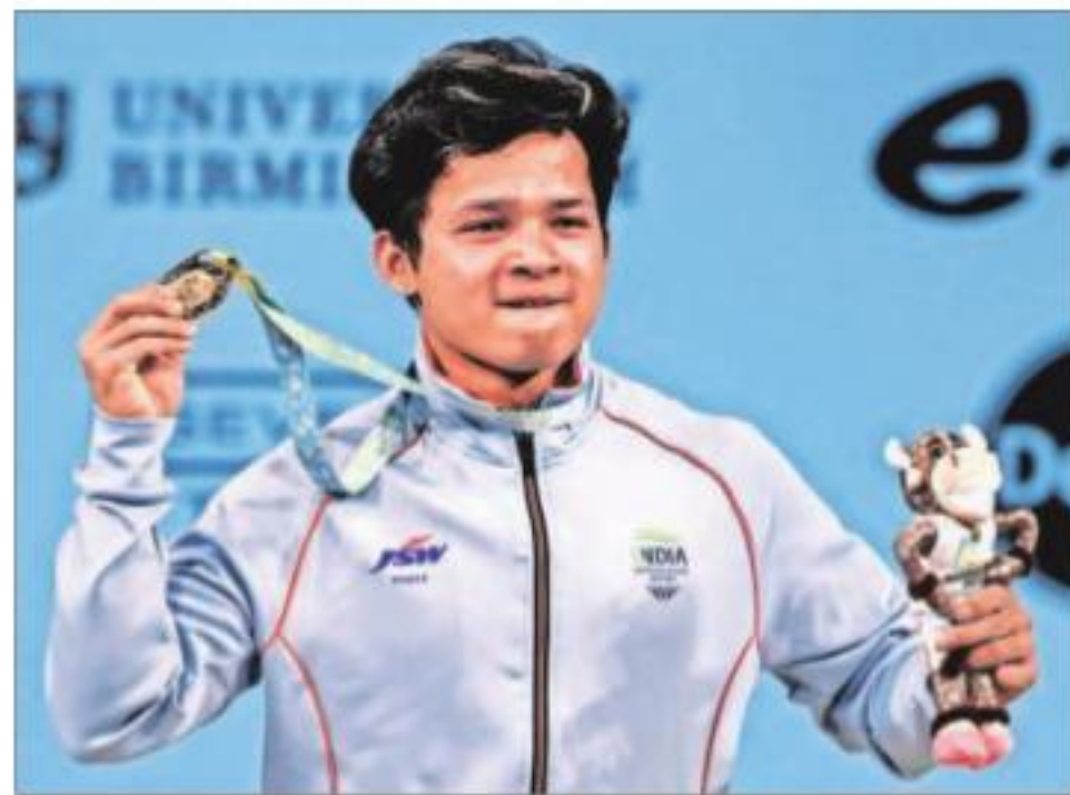
Jeremy Lalrinnunga after winning the gold medal in the men's 67-kg category weightlifting event on Sunday.

What added to the anxiety was cramps he suffered during his clean and jerk effort as pulled his thigh and hamstring muscles. "I completely blanked out and was clueless what was going around me. I was like blind and cried a lot (after the failed attempt)," Jeremy said.