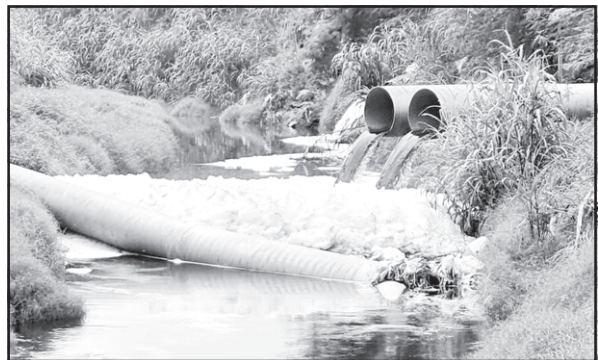
નર્મદા કલીન કલીન ટેક દ્વારા પ્રદૂષિત પાણી શુદ્ધ કર્યા વગર દરિયામાં બારોબાર ઠલવાય છે. તે સ્થળની તસ્વીર.

અમલાખાડીમાં મોટા બે પાઈપો દ્વારા છોડવામાં આવી રહ્યું છે. આ બાબત ફરિયાદ જીપીસીબીને કરતા જીપીસીબી દ્વારા સ્થળ તપાસ અને સેમ્પલો લઈ કાર્યવાહી હાથ ધરી છે. પીરામણ પંચાયતના તલાટી રૂબરૂ પંચકેશ કરી પોલીસમાં અરજી આપવામાં આવી છે.