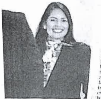
(L) and Home Secretary Priti Patel

wear their traditional 'Kurtas'... Most strikes are through... It took nearly half century... The first... Representatives for the... The... Some... The... Hill... makes... them