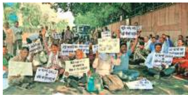
The workers declared the strike on Monday. Express

The protest comes at a time when the city has reported 56 dengue cases in a week, taking the total cases in July to 121 — the highest for the month since 2018. According to a report by the MCD, 11 malaria cases have been reported in a week. This year, the city has seen 243 cases of dengue and 72 cases of malaria, of which 34 malaria