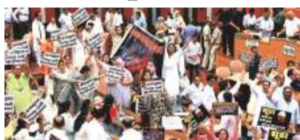
AAP and BJP councillors at MCD House, Monday.

"AAP leaders ran away from discussion on sensitive issues,