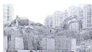
Clearance work of debris under at the site of the demolished twin towers of Supertech in Noida

The twin towers, nearly 100 metres tall, were demolished on Sunday. More than 3,700 kg