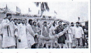
শুভেন্দুপুরে রাজ্য সরকারের বিরুদ্ধে আন্দোলন চালাচ্ছেন মানুষ।

নিম্ন প্রতিবেদন, শুভেন্দুপুর: রাজ্য সরকারের বিরুদ্ধে আন্দোলন চালাচ্ছেন শুভেন্দুপুরের মানুষ।