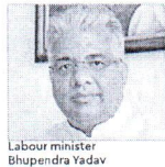
Labour minister Bhupendra Yadav

A DELEGATION OF journalists on Saturday met labour minister Bhupendra Yadav to flag concerns arising from the proposed implementation of the labour codes that had subsumed laws pertaining to working journalists.