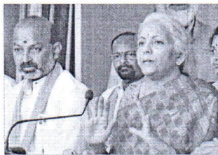
Finance minister Nirmala Sitharaman speaks to media as Telangana's Bharatiya Janata Party president Bandi Sanjay Kumar (left) looks on in Hyderabad on Saturday

Speaking to media persons here, she quoted reports saying the country has zero per cent chance of slipping into recession. "I hope for (double-digit growth). We will work for it... So you're not on the verge of recession, it gives me the confidence that you are constantly responsive in terms of the sections which need hand-holding, in terms of the boost that we have to give to the economy," she said when asked if she expects double-digit growth in the gross