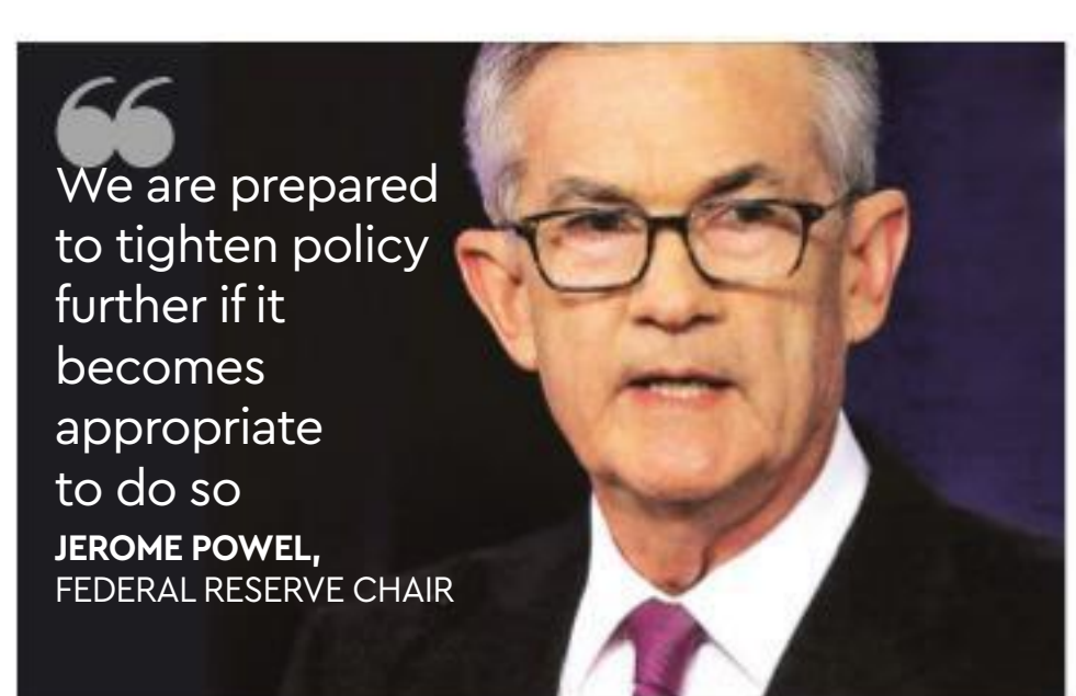
We are prepared to tighten policy further if it becomes appropriate to do so JEROME POWELL, FEDERAL RESERVE CHAIR

FEDERAL RESERVE CHAIR Jerome Powell pushed back against Wall Street's growing expectations of interest-rate cuts in the first half of 2024, saying the committee will move cautiously with borrowing costs at a 22-year high but retain the option to hike further. "It would be premature to conclude with confidence that we have achieved a sufficiently restrictive stance, or to speculate on when policy might ease," Powell said Friday at an event in Atlanta. "We are prepared to tighten policy further if it becomes appropriate to do so." Powell signaled that Fed officials expect to leave interest rates steady when they meet Dec. 12-13, giving themselves more time to evaluate the economy after raising rates aggressively from near zero in March 2022 to above 5% in July. A slowing US economy and fall in the inflation rate have raised expectations among investors that the central bank could begin to cut