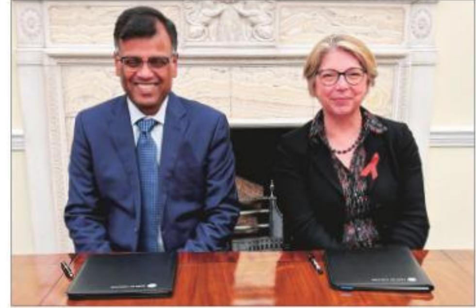
RBI deputy governor T Rabi Sankar and Bank of England deputy governor for Financial Stability Sarah Breen

THE RESERVE BANK of India (RBI) and the Bank of England (BoE) on Friday signed an agreement for cooperation and exchange of information related to Clearing Corporation of India Ltd (CCIL). The agreement will help facilitate British lenders to continue settling bond and forex trades on CCIL. The move will help Bank of England assess the CCIL's application to be recognised as a third country counterparty, essential to UK banks settle transactions through it, the RBI said in a statement on Friday. The accord would pave the way for British banks like Bar-