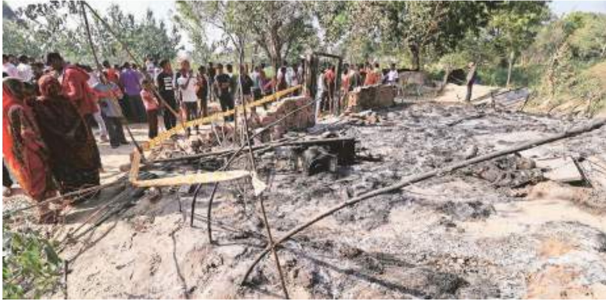
The remains of the hut at Madauli village of Kanpur Dehat. Vishal Srivastava