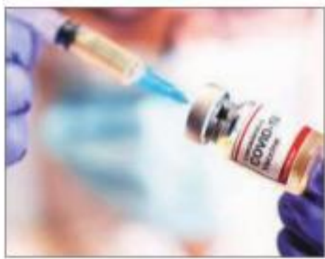
mass vaccinations from as early as next week.

AIIMS DIRECTOR RANDEEP Guleria on Thursday pinned his hopes on the five Covid-19 vaccine candidates which are in advanced stages of clinical trial in India, saying they are logistically feasible for distribution in both urban and rural areas. His assertion follows the Pfizer-BioNTech's vaccine getting emergency clearance in the UK, paving the way for