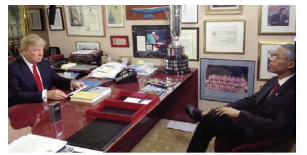
Trump with an Obama lookalike whom he belittled, says the book

alongside evacuation orders. There were no immediate reports of any injuries in Okinawa, home to more than half of the roughly 50,000 US troops based in Japan under a bilateral treaty. Haishen was not only powerful - equivalent to a Category 2 hurricane - but also large in its reach, according to the meteorological agency. Bullet trains were temporarily halting services, and dozens of flights were canceled. All Nippon Airways said such cancellations will continue Monday and possibly on Tuesday for flights in southern Japan, such as Yamaguchi, Kochi and Fukuoka. Haishen's projected course has it hitting the Korean Peninsula later in the week. Haishen's course is similar to Typhoon Maysak, which lashed southern Japan last week, injuring dozens of people and cutting power to thousands of homes.