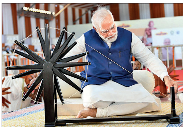
The PM was speaking on the banks of the Sabarmati, where 7,500 women simultaneously spun the 'charkha' to mark the 75th year of Independence

"No force can stop khadi from going global from local. Khadi can play a global role. We must take pride in our heritage and the world will respect it. Like during the freedom struggle, Khadi can inspire in fulfilling the promise of a developed India and a self-reliant India. I foresee the day when khadi will be available at all leading clothing outlets of the world," PM Modi said at the function. Commenting on Union